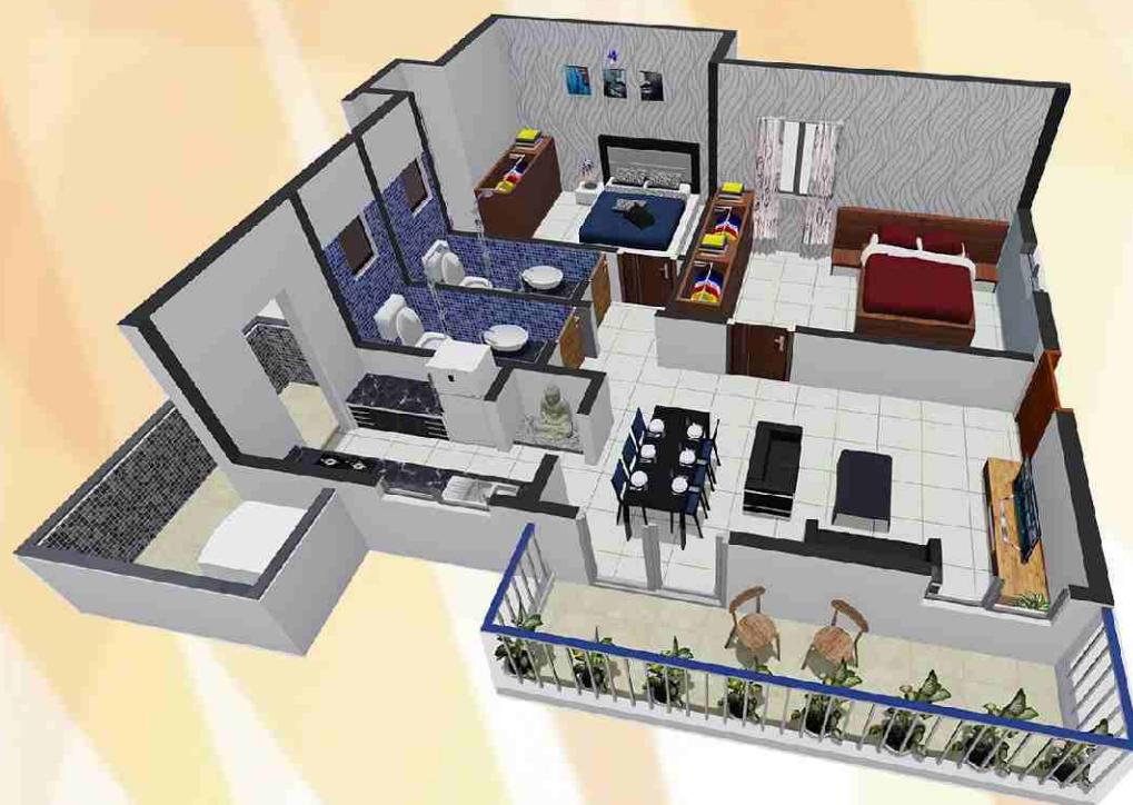
Unit Size: 1140 Sq.ft. North Facing Type: 4