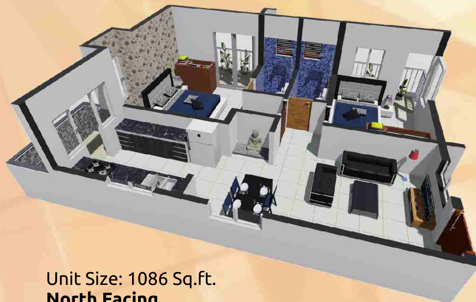
Unit Size: 1086 Sq.ft. North Facing Type: 1