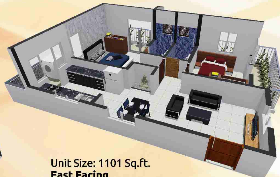
Unit Size: 1101 Sq.ft. East Facing Type: 2