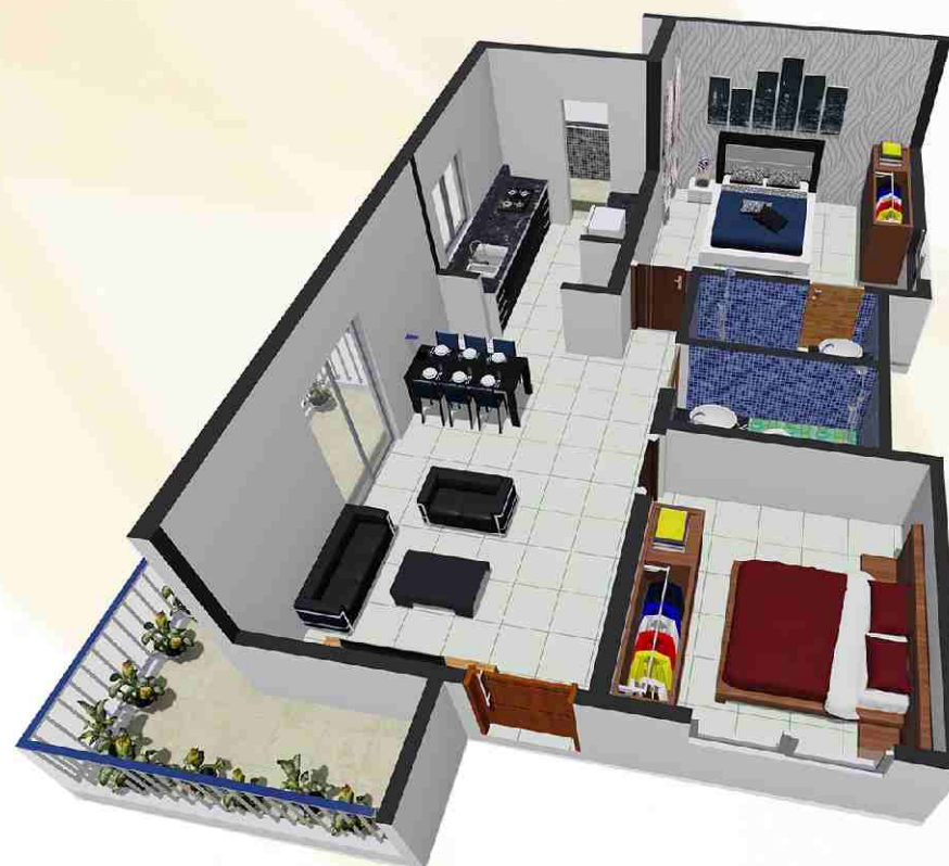
Unit Size: 1175 Sq.ft. North Facing Type: 3